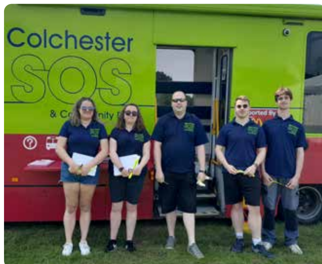
RaverTots Welfare Team