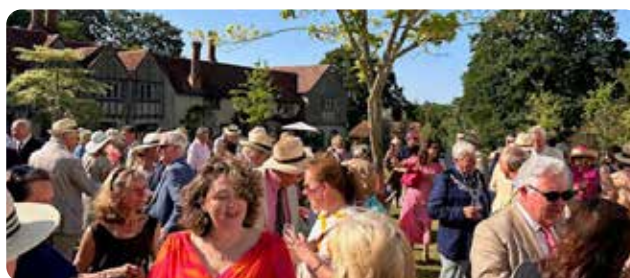
High Sheriff Garden Party