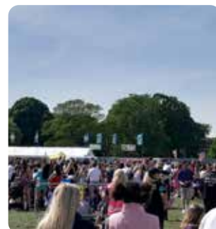
Maidstone RaverTots 2023