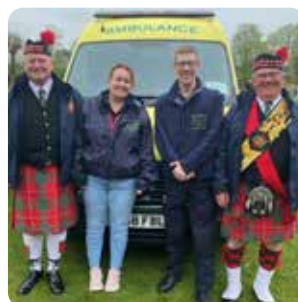
Colchester Drum & Pipes band