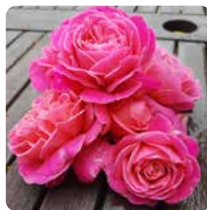
Walled Garden Flowers