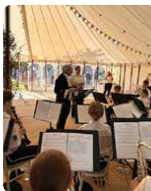
High Sheriff leading garden party orchestra