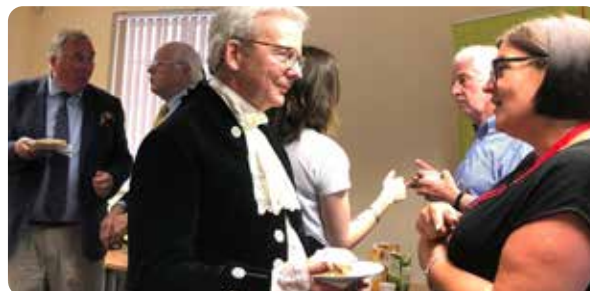
High Sheriff meets our guests over lunch