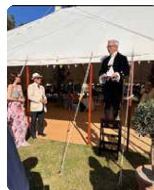
High Sheriff addressing guests