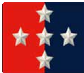
1st Military Police Brigade Military Formation