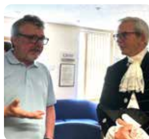
High Sheriff meeting some of our head office team