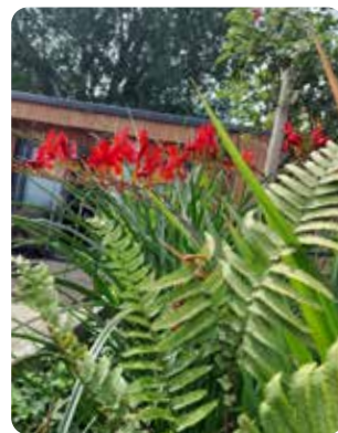
Crocosmia & Walled Garden meeting room behind