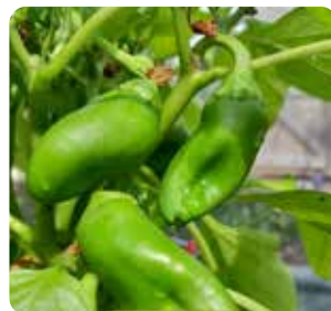
Green peppers grown from seed