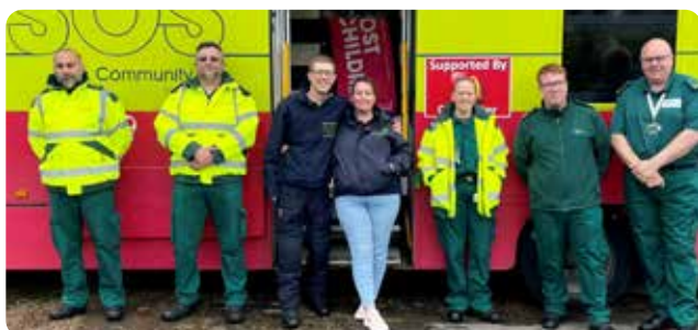
Coronation Weekend Welfare Team

If you are interested being an SOS Bus volunteer, please visit our website www.openroad.org.uk or please contact our head office on 01206 369782 to speak to a member of the SOS team.